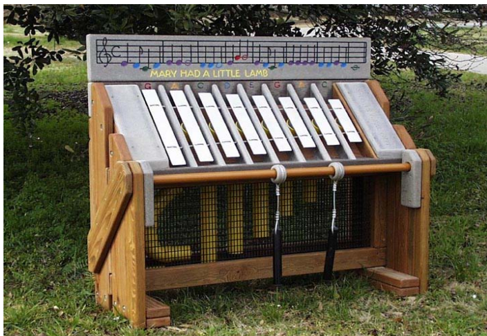
Soprano Metallophone, pentatonic scale, lowered pre-school height, (southern yellow pine) Music panel

Accessible musical instruments for people of all ages to enjoy self-expression and build community through music.