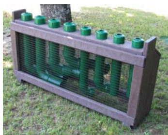
Diatonic Palm Pipe Drum