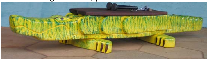
Alligator Drum, painted and sealed