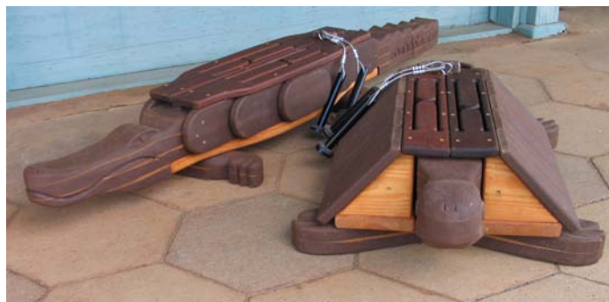
Alligator Drum, stained and sealed