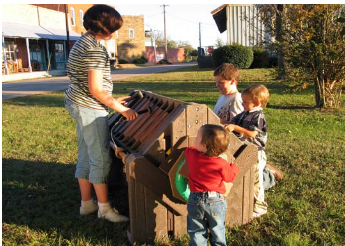
Preschool Music Station.