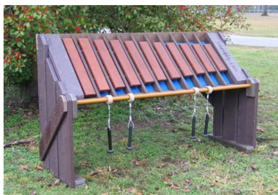
Amadinda, diatonic scale (post consumer plastic),

AMADINDAS Ipe' (Brazilian hardwood) tone bars without resonators