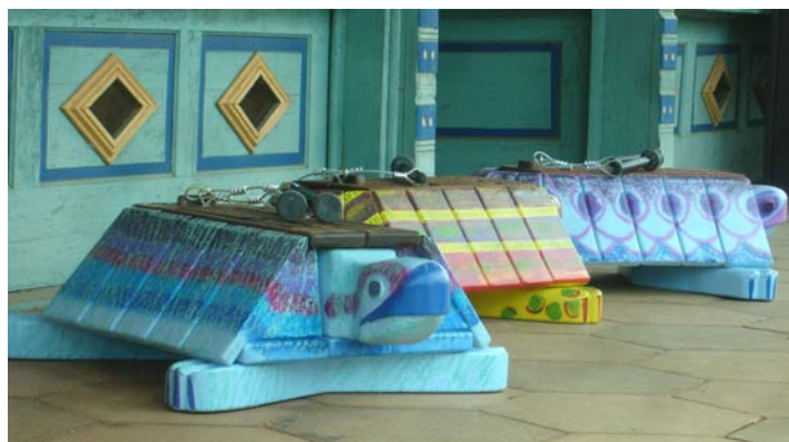
Box Turtle Drums, painted & sealed

Note: Animal drums must be fastened down for optimal sound and safety.