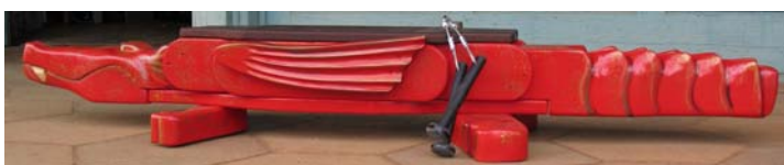
Dragon Drum, painted and sealed